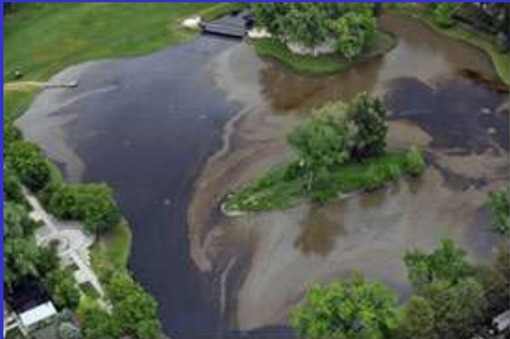
Oil spilling into Salt Lake City's Liberty Park